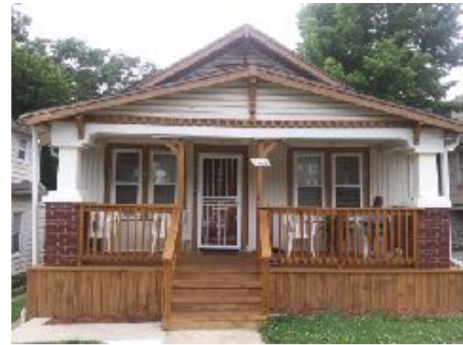
Our Men's Transitional Home