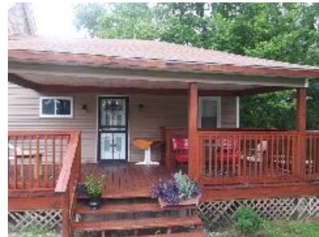
"Shanna's House"-Our Women's Transitional Home