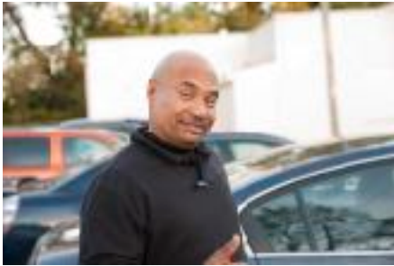
Director of Transitional Housing: